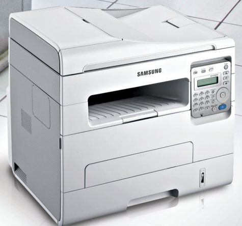
Samsung Mono Laser Multifunction Printer SCX-4729FW

The simple and environmentally tuned multifunctional printer Simply delivers stunning and green-inspired performance to your office with easy Eco button