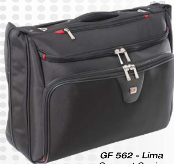
GF 562 - Lima Garment Carrier