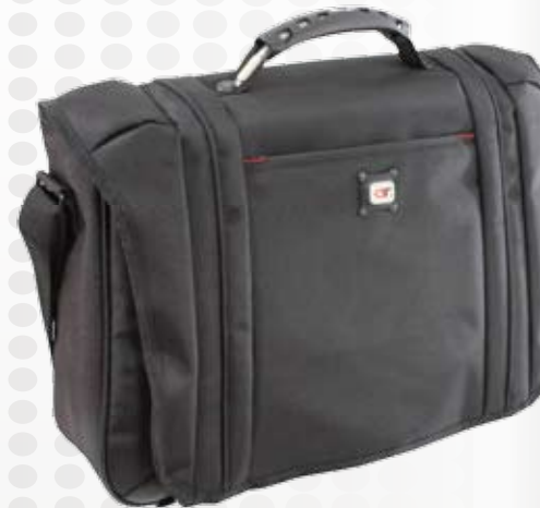
GF 522 - Zeon Fits up to 17" laptop