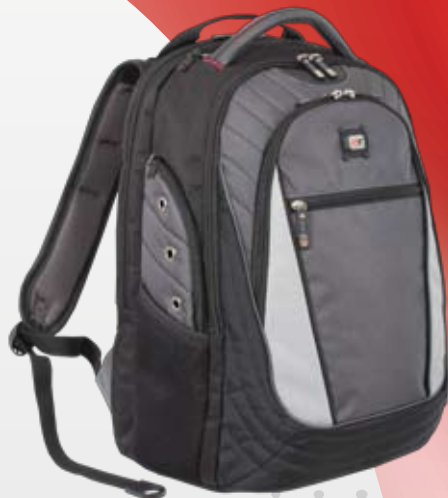
GF 504 - Argo Fits up to 16" laptop