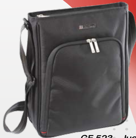
GF 523 - Juel 13" - Fits up to 13" netbook