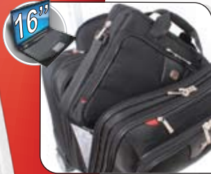
16" Laptop Slim Case (nests into main laptop compartment)