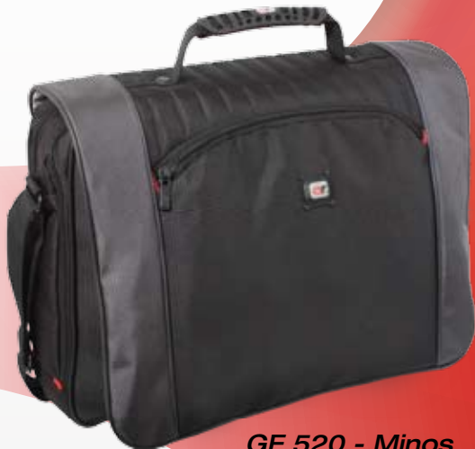
GF 520 - Minos Fits up to 16" laptop