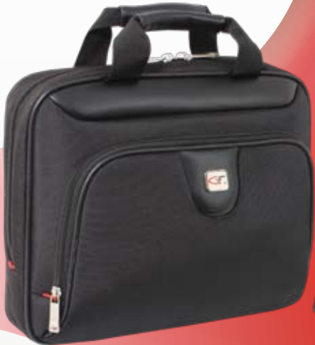
GF 541 - Jet Fits up to 13" notebook