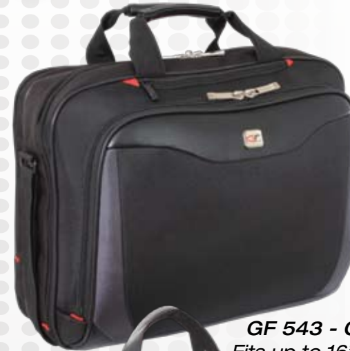
GF 543 - Cedra Fits up to 16" laptop