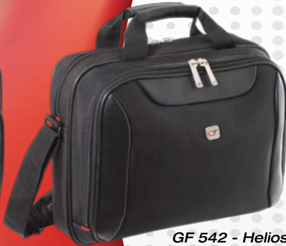
GF 542 - Helios Fits up to 16" laptop