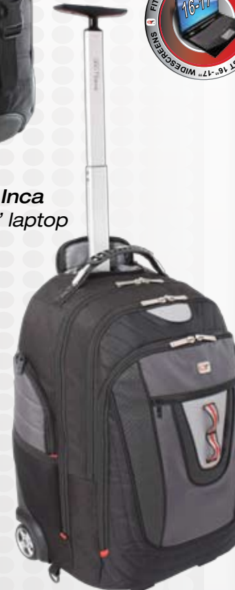
GF 506 - Brio Fits up to 17" laptop