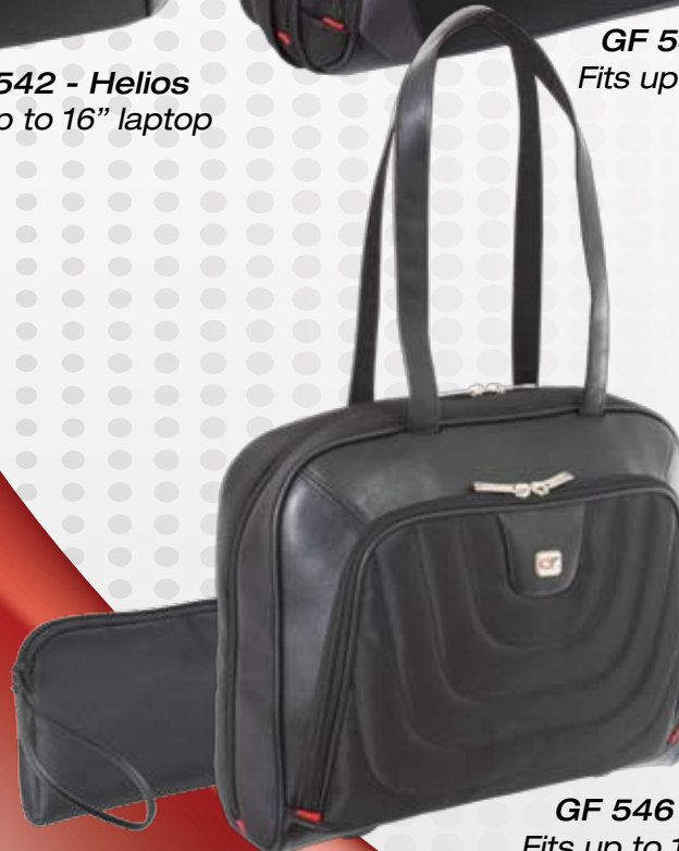
GF 546 - Jade Fits up to 16" laptop