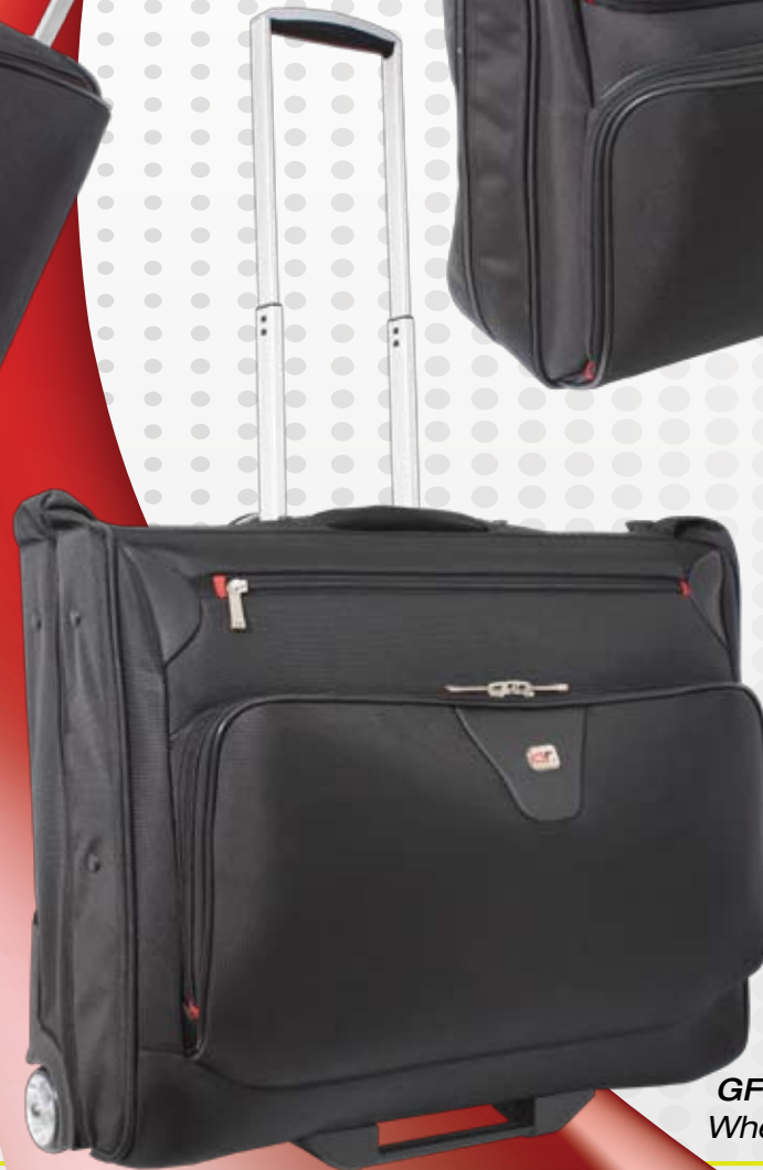
GF 563 - Manhattan Wheeled Garment Bag