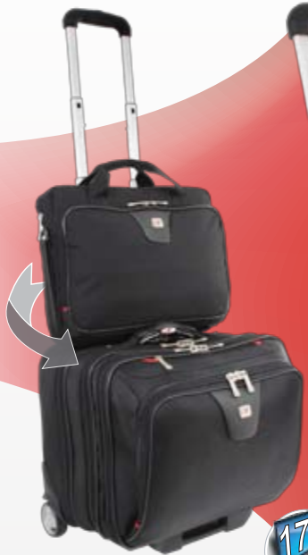
GF 547 - Madison Wheeled Laptop Case with Removable Laptop Slim Case