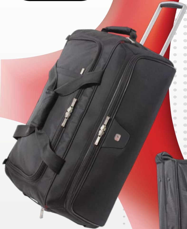
GF 561 - Barbican 29" Wheeled Holdall