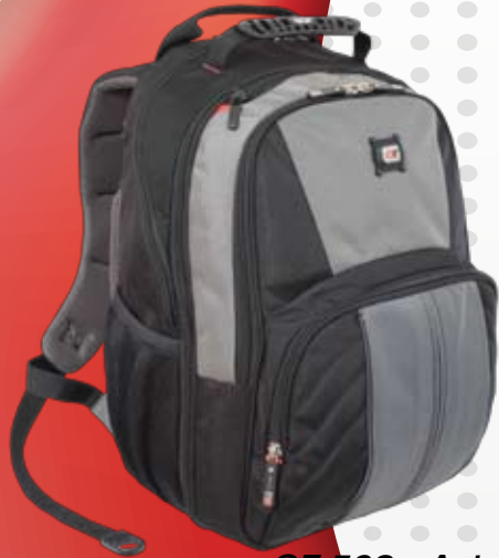
GF 502 - Astor Fits up to 16" laptop