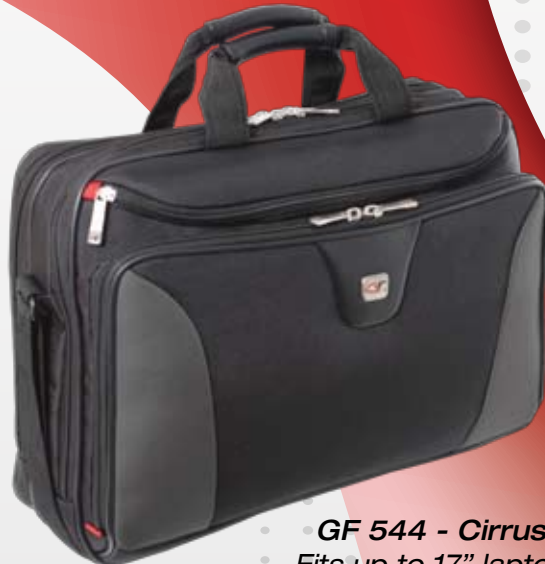
GF 544 - Cirrus Fits up to 17" laptop