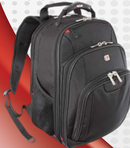
GF 505 - Andra Fits up to 16" laptop