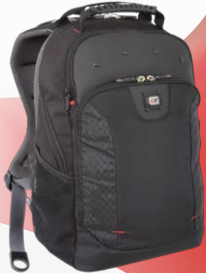
GF 501 - Juno Fits up to 16" laptop