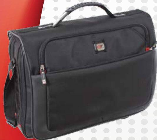
GF 521 - Titan Fits up to 17" laptop