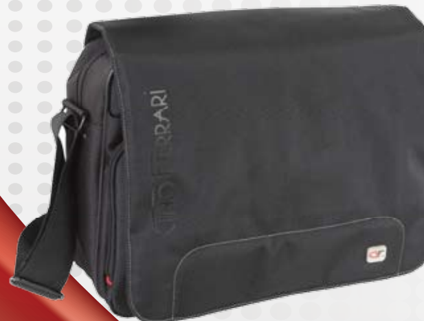
GF 525 - Opus Fits up to 16" laptop