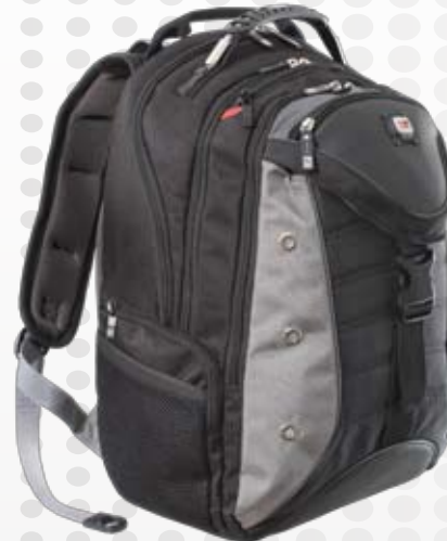
GF 503 - Inca Fits up to 17" laptop