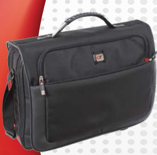
GF 521 - Titan Fits up to 17" laptop