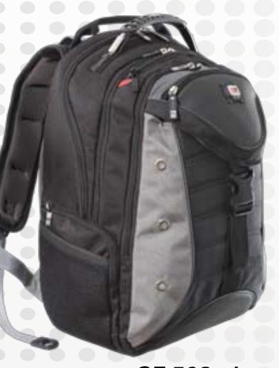
GF 503 - Inca Fits up to 17" laptop