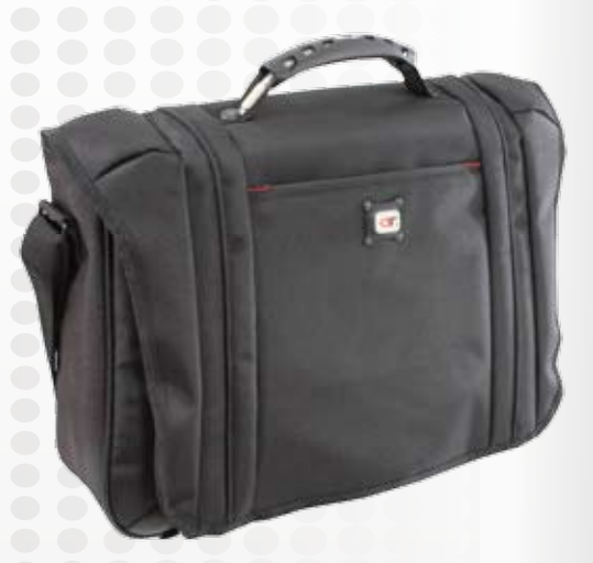
GF 522 - Zeon Fits up to 17" laptop