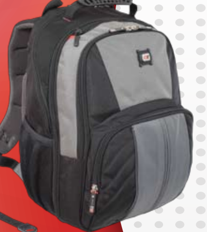
GF 502 - Astor Fits up to 16" laptop