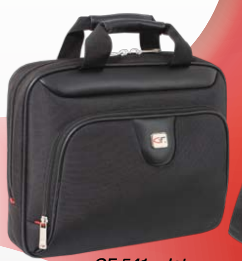
GF 541 - Jet Fits up to 13" notebook