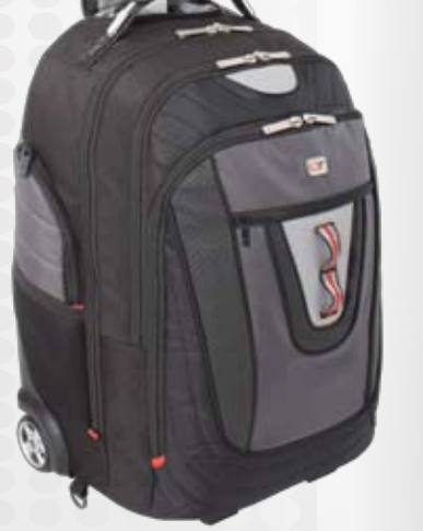
GF 506 - Brio Fits up to 17" laptop