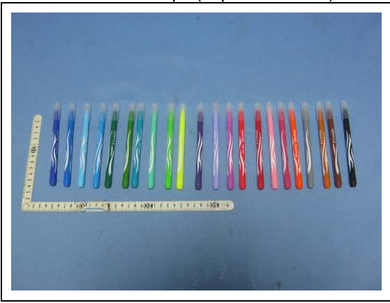
Received sample(cap opened view)