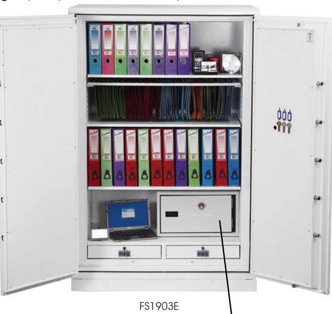
Shown with optional Data Protection insert (FSDPI03) for models FS1902E and FS1903E only.

Optional Extras Available Height adjustable shelves Suspended filing cradles Fingerprint lock Data Protection Insert (FS1902E & FS1903E only)