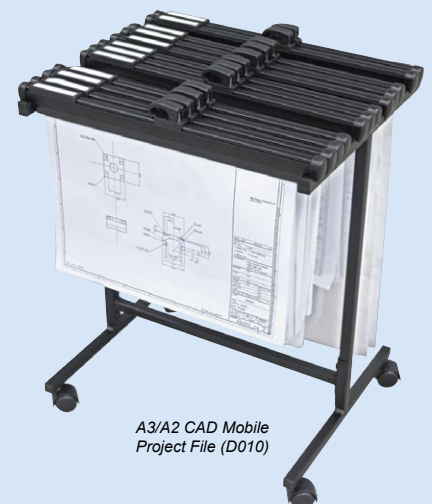
A3/A2 CAD Mobile Project File (D010)