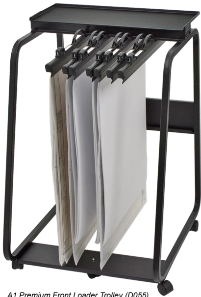
A1 Premium Front Loader Trolley (D055) with Systems Shelf (D056) & QUICKFILE Clamps (D200B)