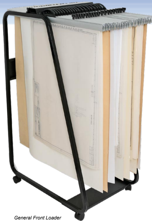
General Front Loader Trolley (D060) & GENERAL Clamps (D102A)

Hang-A-Plan Front Loader trolleys and wall racks provide clear and easy access to all drawings. Binders may be pivoted and removed from the front of the trolley without any obstruction. The trolleys are made from high strength steel frames finished in a satin black scratch resistant powder coat. The top channel, used for suspending binders, features an extra hard wearing nylon coated finish.