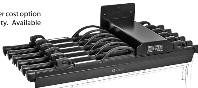
Front Loader Wall Rack WR1200 (D065)

The General Trolley is a lower cost option and has a 20 binder capacity. Available in A1 or A0 Size.