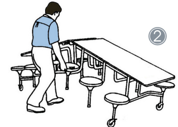
Continue to lift using centre stools.