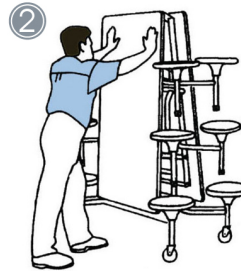
Do NOT push the surface of the table.