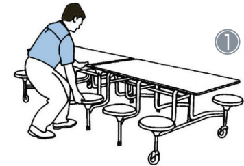
Release locking bar by pressing down on the table surface, with right hand lift clear the lock.