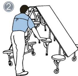
Continue opening by pressing down with both hands on the middle stools.