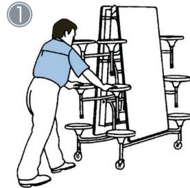
With travel lock engaged push from the seats as shown.