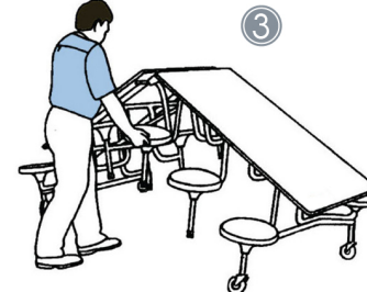
Continue opening by pressing down with both hands on the centre stools.