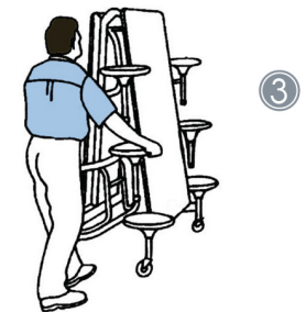
Using the middle stools push together to engage travel lock.