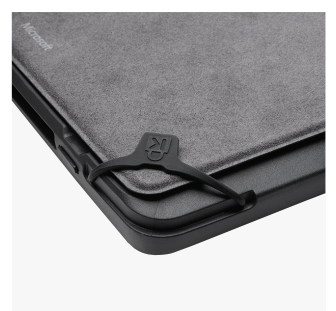
Keyboard holder and TypeCover strap

Conveniently secures and stores Surface Slim Pen.