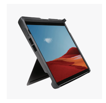
Designed exclusively for Surface Pro

Part Number - K97323WW | 0 85896 97323 2