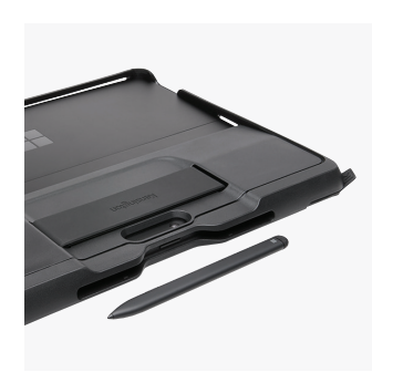
Surface Slim Pen holder

Hand strap provides a firm grip when in use and stows when not in use, which allows the device to lie flat and stable.