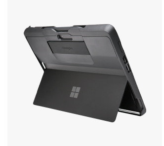
Full access to all ports and integrated Surface Pro kickstand

MIL-STD-810G drop-tested means this case is ready for anything.