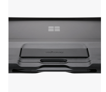
Self-adjusting hand strap

Hand strap provides a firm grip when in use and stows when not in use, which allows the device to lie flat and stable.