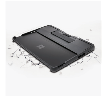
Military-grade drop protection

Certified by Microsoft for the highest quality, form, fit and function.