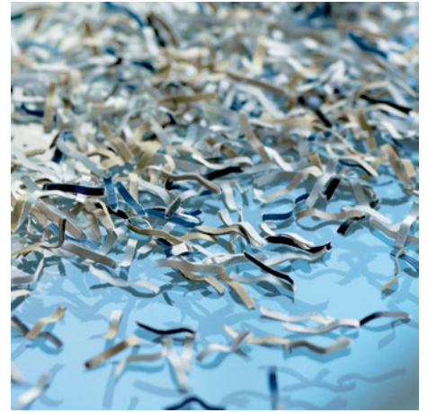
P-5 security: recommended, for example, for data media containing secret data