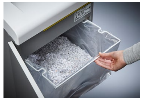
Dahle Security 514 document shredder