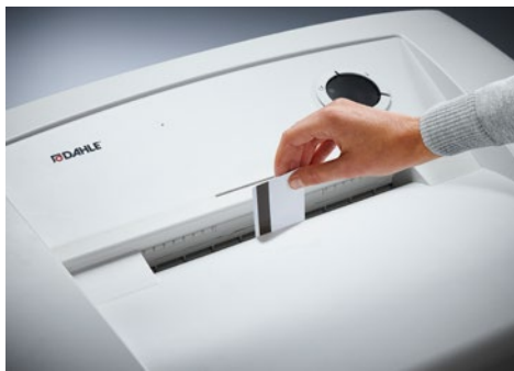
Dahle Security 514 document shredder