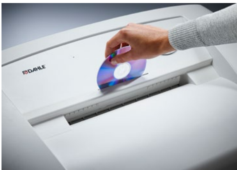
Dahle Security 514 document shredder