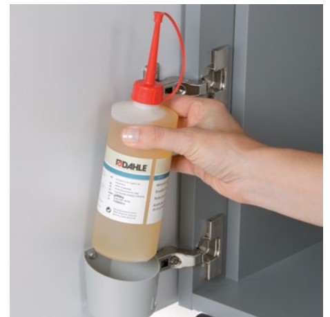
Environmentally friendly oil is always easy to access, included with all cross-cut models