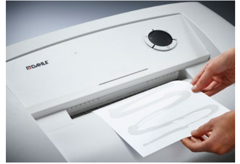
Dahle Security 514 document shredder