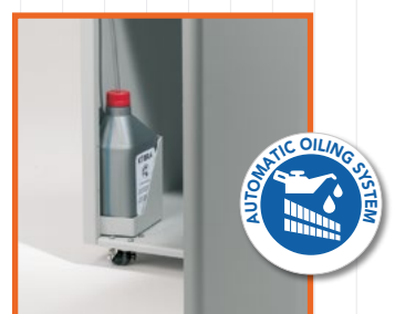
AUTOMATIC OILER: integrated automatic oiling system to lubricate the cutting knives