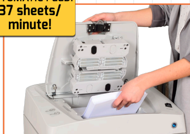
Up to 400 sheets paper tray for auto-feed system: 37 sheets per minute shredding speed