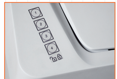
(Option) 4 Digit Electronic Combination Lock