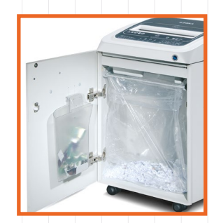
TWO DISTINCT BINS Two integrated and removable bins to separate shredded paper from plastic shreds.