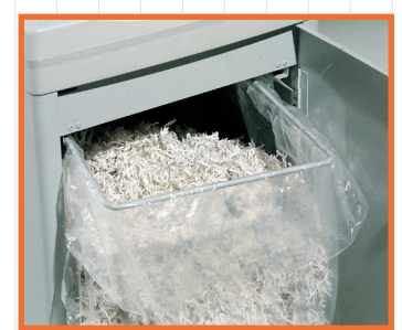
FRONT DOOR FOR EASY EMPTYING of collection bag holding high volume of shredded materials.

Power management system with optical indicators for power saving stand-by mode