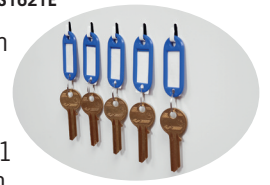
Internal Key Hooks

+ Suitable for storage of controlled drugs whose active ingredients do not exceed 500 grams.