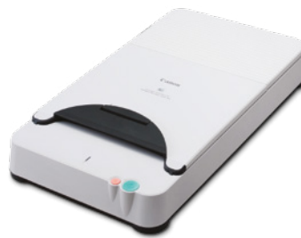
A4 Flatbed Scanner Unit 101

Scan bound books, journals and fragile media by adding the Flatbed Scanner Unit 101 for documents up to A4 or Flatbed Scanner Unit 201 for A3 scanning. Connected by USB, these flatbed scanners work seamlessly with the DR-6030C in a smooth dual scanning operation that lets you apply the same image-enhancement features to any scan.