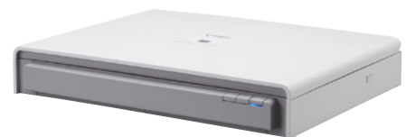
A3 Flatbed Scanner Unit 201