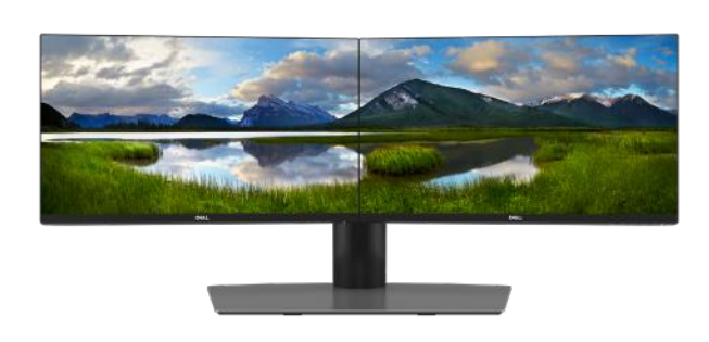
DELL 24 MONITOR P2419H WITH DELL DUAL MONITOR STAND | MDS19

Optimize your dual monitor setup to improve productivity and reduce desktop clutter.