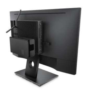
WYSE 5070 BEHIND THE MONITOR MOUNT FOR E-SERIES MONITORS

Optimize your dual monitor setup to improve productivity and reduce desktop clutter.