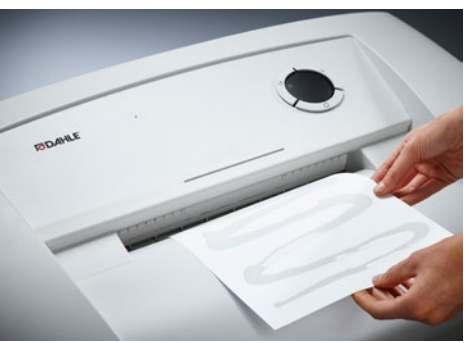
Dahle Office 414 document shredder