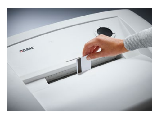
Dahle Office 414 document shredder