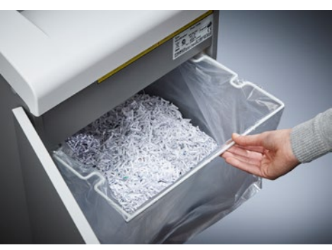
Dahle Office 414 document shredder