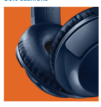
Soft, breathable ear cushions provide great comfort over long listening sessions.