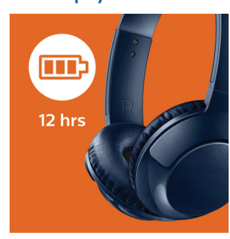
With 12 hours of playtime, you'll have enough power to keep your music going all day.