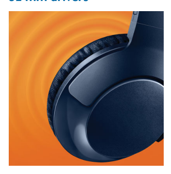
BASS+ headphones feature 32mm speaker drivers that produce big, pumping bass.