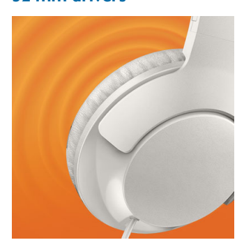
BASS+ headphones feature 32mm speaker drivers that produce big, pumping bass.