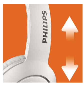
Designed for optimal fit, BASS+ headphones feature swivelling earshells and an adjustable headband to ensure a great fit for all wearers.