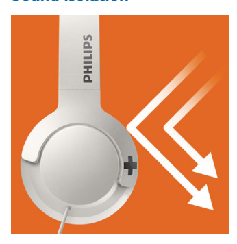
With a closed acoustic design, BASS+ headphones block out ambient noise to create improved sound isolation for a better listening experience.