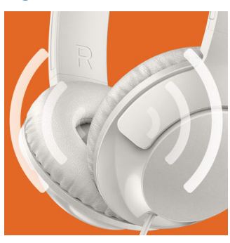
This is big, powerful bass that lets you really feel the beat. Don't let the sleek design fool

you – specially tuned drivers and bass vents produce ultra-low end frequencies to create a unique BASS+ sound signature.