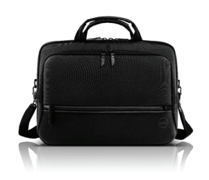
DELL PREMIER BRIEFCASE 15 | PE1520C

With fast high-power delivery of up to 65Wh, this power bank can charge the widest range of USB-C laptops, and mobile devices.