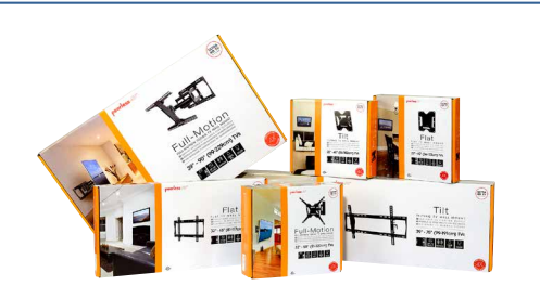
Comes in color packaging with included installation hardware and easy to follow instructions.