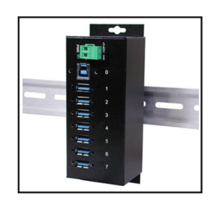
Din Rail Mounting

This manual may make reference to trademarks, registered trademarks, and other protected names and/or symbols of thirdparty companies not related in any way to StarTech.com. Where they occur these references are for illustrative purposes only and do not represent an endorsement of a product or service by StarTech.com, or an endorsement of the product(s) to which this manual applies by the third-party company in question. StarTech.com hereby acknowledges that all trademarks, registered trademarks, service marks, and other protected names and/or symbols contained in this manual and related documents are the property of their respective holders.