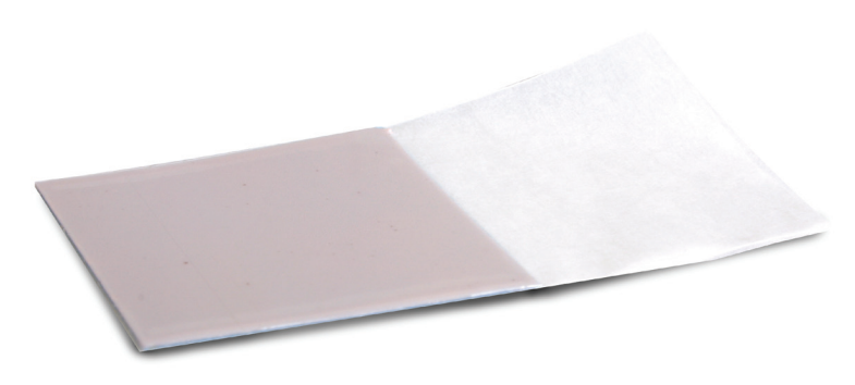
*actual product may vary from photos

2. Place the compound (adhesive side down) to the bottom of the heatsink. Generally, affixing the pad to the center of the heatsink offers the best performance.