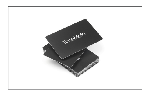
TimeMoto RF-100 set of 25 RFID badges Art. no: 125-0603