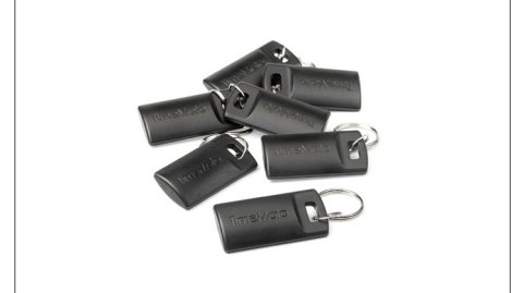
TimeMoto RF-110 set of 25 RFID key fobs Art.no: 125-0604