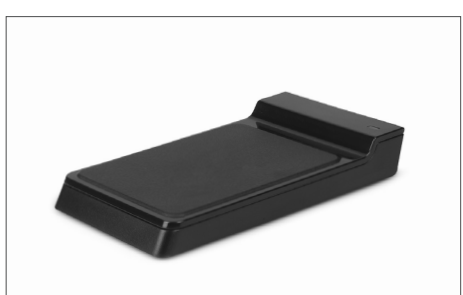
TimeMoto RF-150 USB RFID Reader Art. no: 125-0605