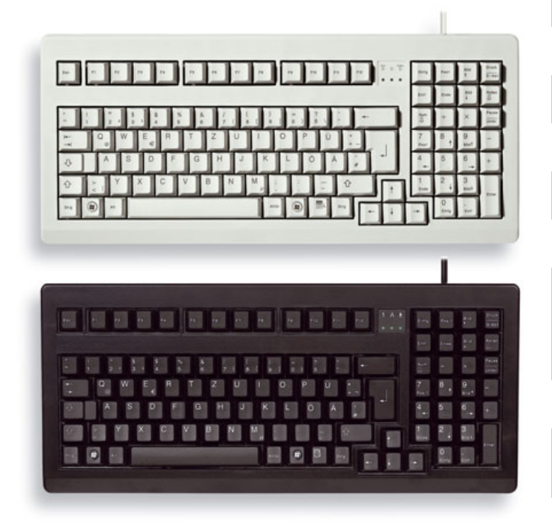
Models may vary from the image shown