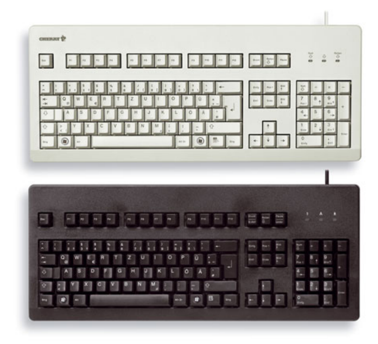
Models may vary from the image shown