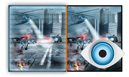
Flicker-free + Blue light

With true 1920 \times 1080 p resolution your monitor is ready to display high definition images. This means you can accommodate more information on your screen; e.g. 60% more in comparison to a 1280 \times 1024 monitor.