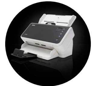
Alaris S2040/S2070 Scanners