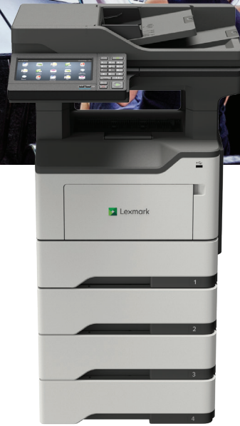
MB2650adwe with optional trays