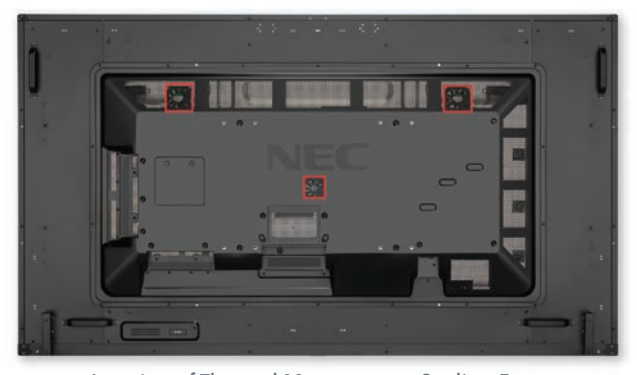
Location of Thermal Management Cooling Fans

Monitoring and managing the temperature of each display is crucial to secure reliability and longevity. An industrial-strength, premium-grade panel with additional thermal protection, internal temperature sensors with self-diagnostics, and fan-based technology allows for 24/7 operation, and protects your display investment. Without thermal management, displays can be prone to damaging heat over time. This damaging heat will lower the picture quality and life expectancy of the product. Integrated cooling fans automatically turn on and stay on when high internal temperatures are detected. These will stay on until the heat is properly dissipated and the display remains under proper temperature thresholds.