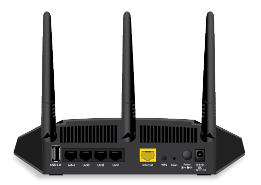
Figure 2. Router back panel

The back panel of the router provides ports, buttons, antenna connectors, and a DC power connector.