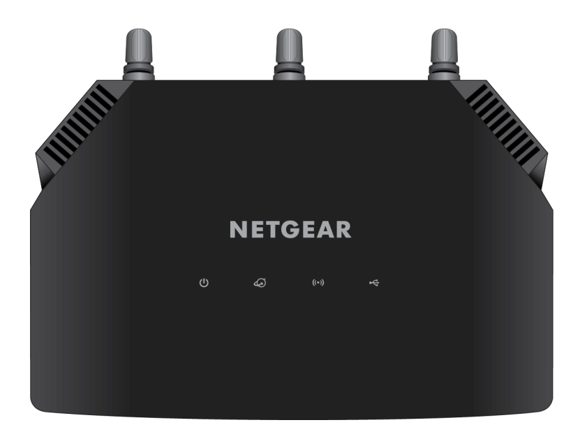
Table 1. LED and button descriptions

The status LEDs and buttons are located on the top of the router.