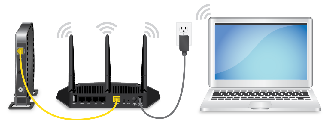
Figure 4. Router cabling

The following image shows how to cable your router: