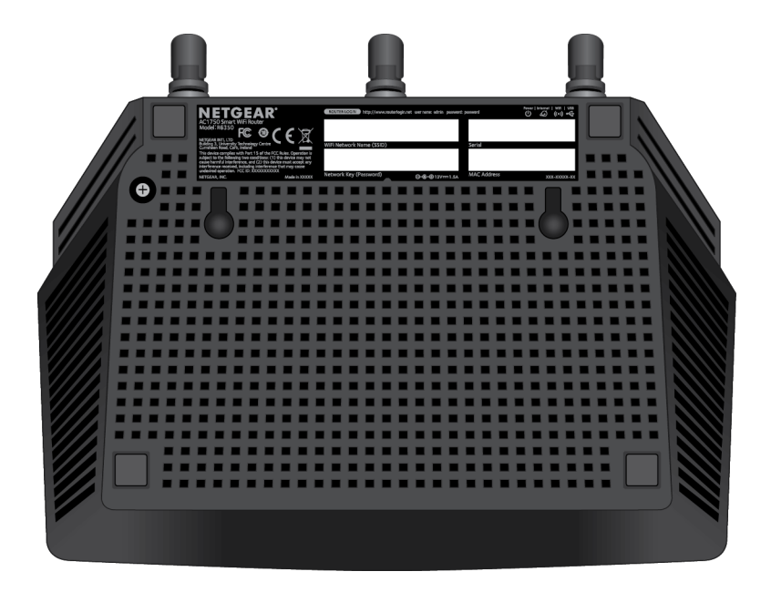
Figure 5. Bottom of the router

Note We recommend using pan head Phillips wood screws, 3.5 x 20 mm (diameter x length, European) or No. 6 type screw, 1 inch long (U.S.).