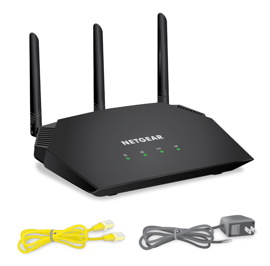
Figure 1. Package contents

Your package contains the router, power adapter, and an Ethernet cable.