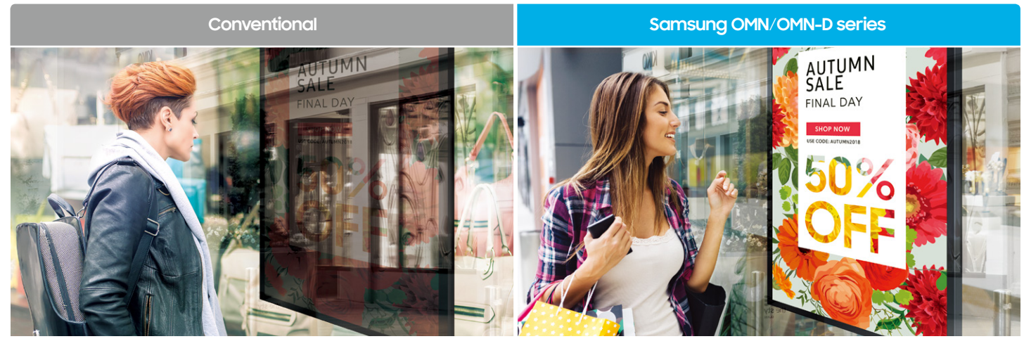
* "Conventional" refers to Samsung's OMD-W series.

Rich, digital content is the new norm. Static, printed billboards and signs lack the dynamic motion necessary to guickly attract the attention of passersby. As retailers are trying to win the attention of the consumer, it is vital to stand out amongst the competition. That is why a growing trend in the retail industry is the introduction of digital signage into window storefronts. Retail organizations have a very narrow window to impress, so it is critical that a customer's first impression is immediately dazzling. Retailers need digital displays with high visibility and easy-to-manage software to deliver highly impactful content that remains bright and crisp even in the face of direct sunlight – a challenge many stores face.