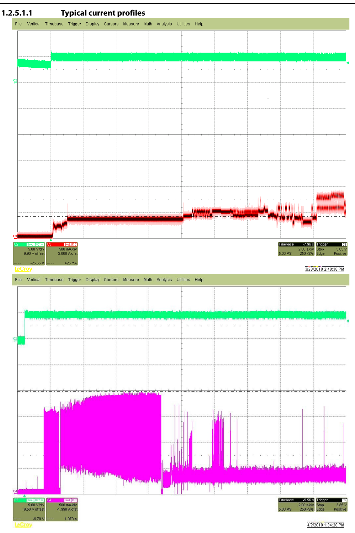
Figure 1. Typical 5V and 12V startup and operation current profiles