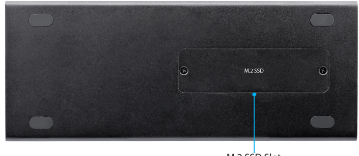
M.2 SSD Slot