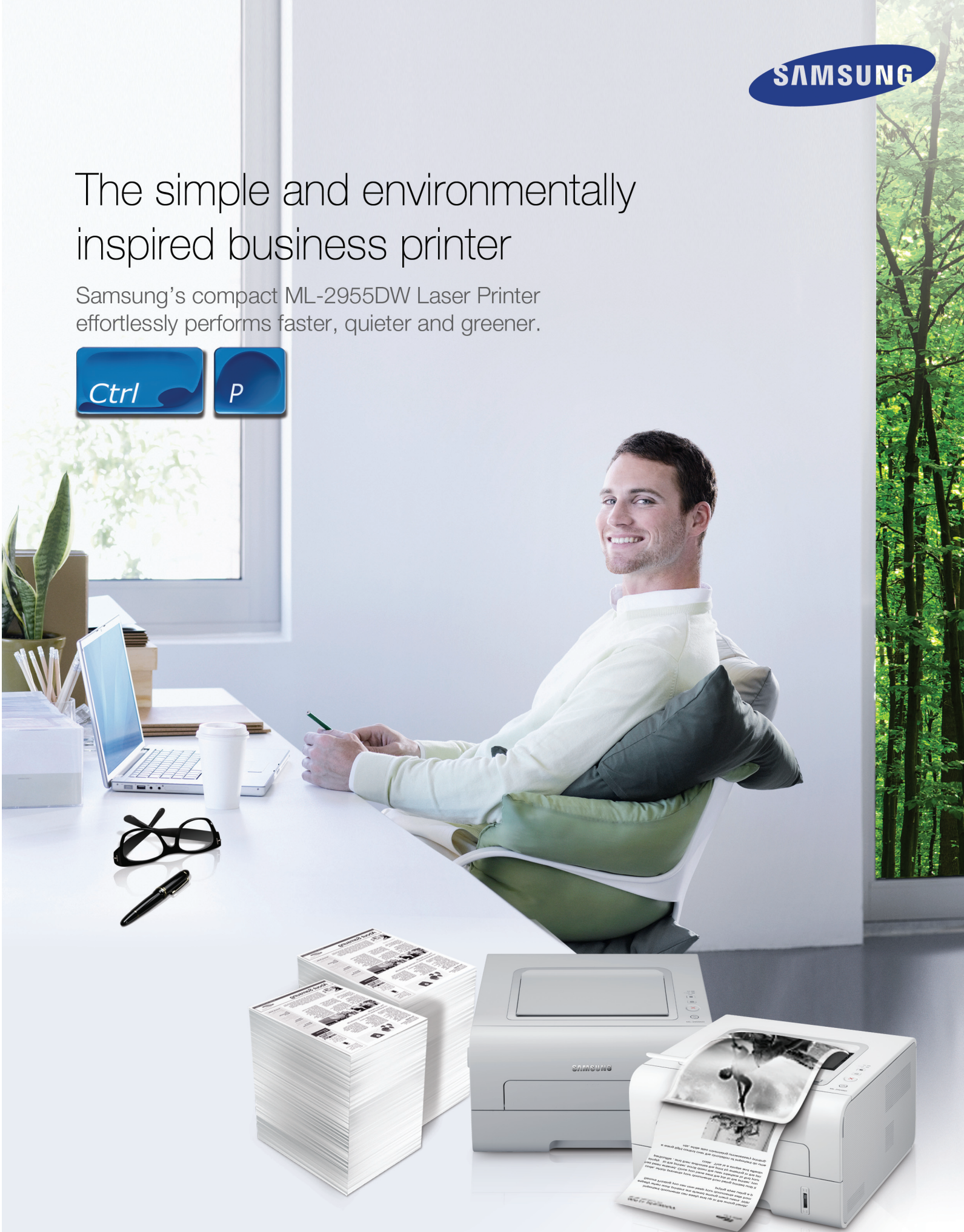
Samsung Monochrome Laser Printer ML-2950/2955 Series