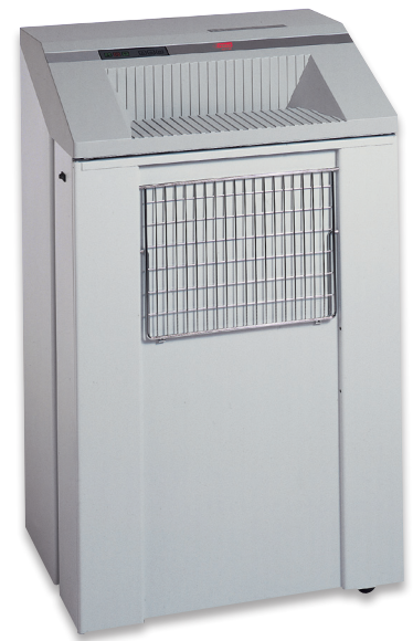
W/D/H 70 x 55 x 112 cm