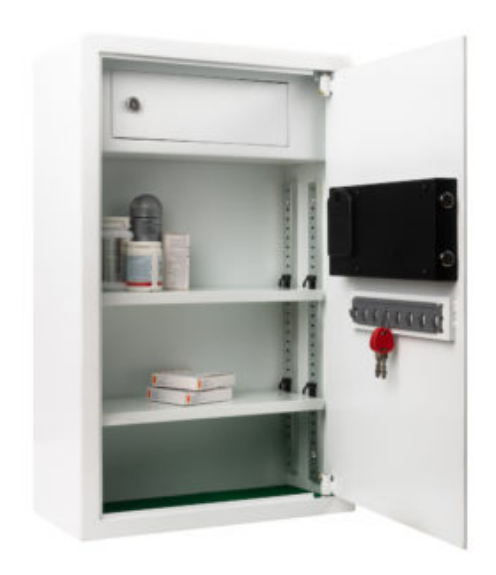
Medicine Cabinet Electronic 200D open