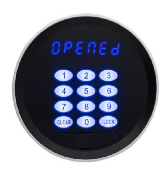
Medicine cabinet Electronic Keypad