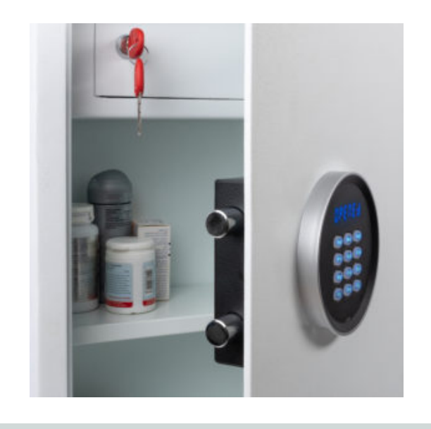
Medicine Cabinet Electronic 200D inset