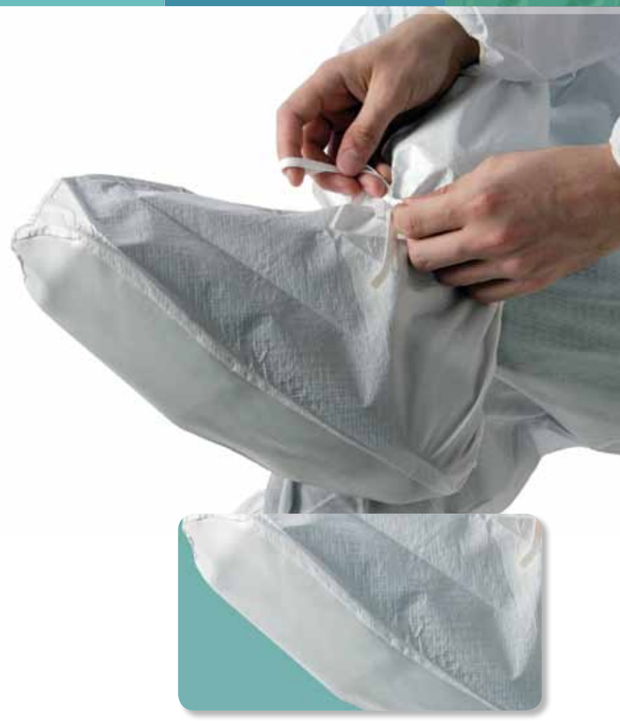
Slip Resistant Sole