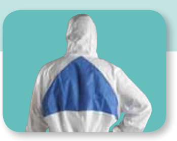
Breathable Back Panel