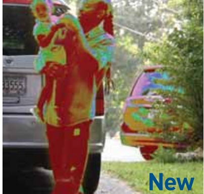
All movement, including objects that don't matter like leaves & trees, triggers motion detection & recording