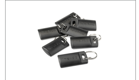
TimeMoto RF-110 set of 25 RFID key fobs Art.no: 125-0604