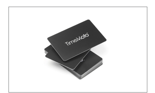
TimeMoto RF-100 set of 25 RFID badges Art. no: 125-0603