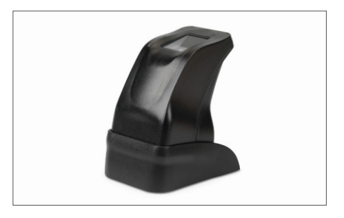
TimeMoto FP-150 USB Fingerprint Reader