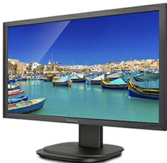
ViewSonic Flicker-Free Technology