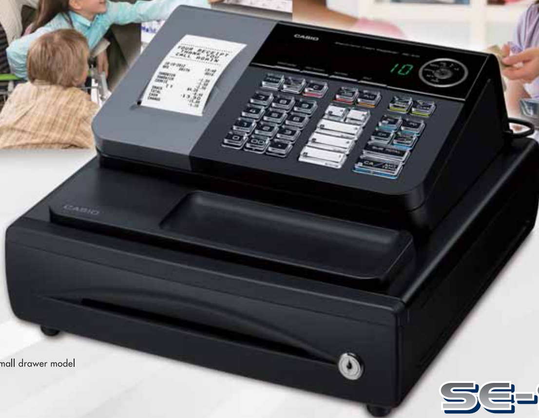
Small drawer model