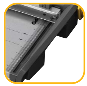
Carry points for easy portability