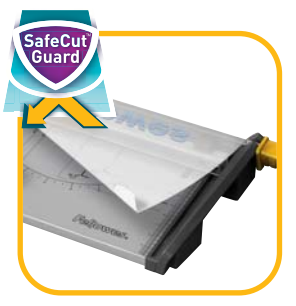
Pre-assembled SafeCut<sup>™</sup> guard prevents setup error