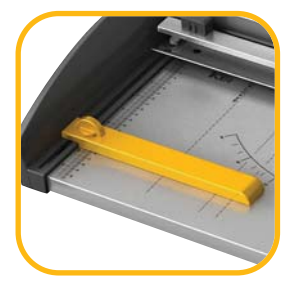
Adjustable back margin for precise repeat cutting