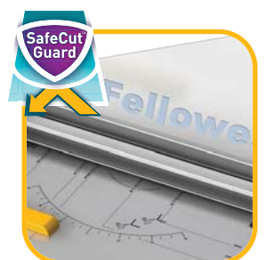
Full size SafeCut <sup>™</sup> Guard prevents mishandling