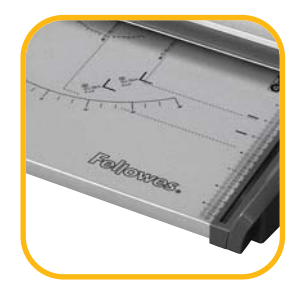
Easy to use cutting guides