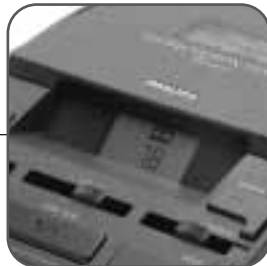
Liquid Crystal Display shows workflow at-a-glance