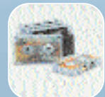
Mini Cassette 005