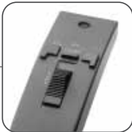
Ergonomically designed 4-Position Switch on microphone