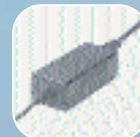
Power Supply 155