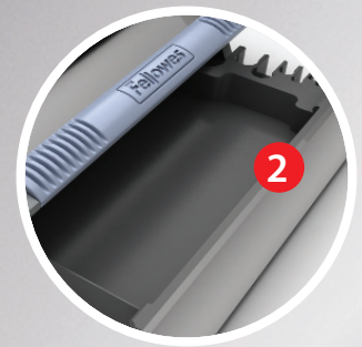
GALAXY 500 MODEL SHOWN