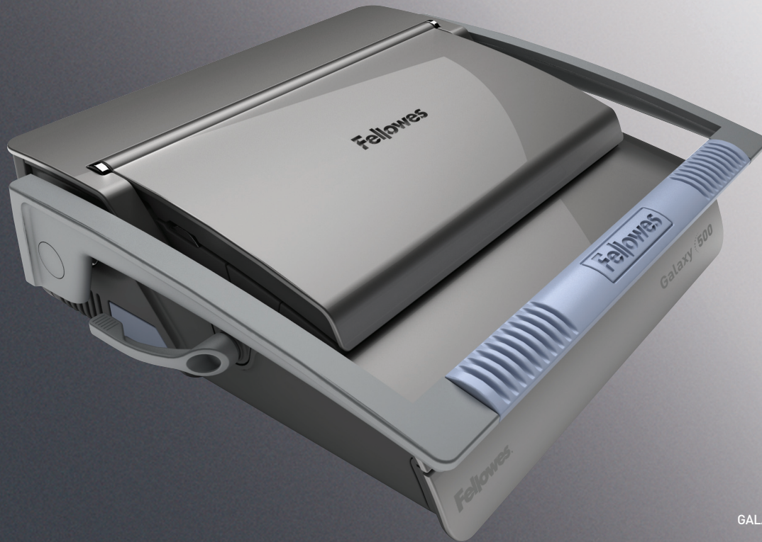
GALAXY 500 MODEL SHOWN