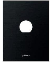
Titanium Black (B)