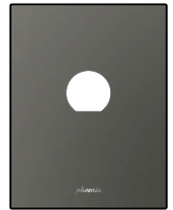
Metallic Silver (S)