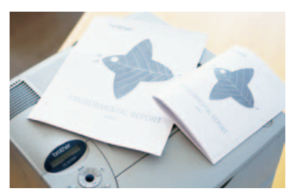
Booklet printing Reduce an A4 32 page document into an A5 8 page booklet!

Booklet printing becomes as simple and easy as any other form of printing and creates an altogether more professional range of documents for both internal and external presentations. For instance, a 32 sheet A4 document can be reduced to an A5 booklet comprising of 8 A4 sheets.