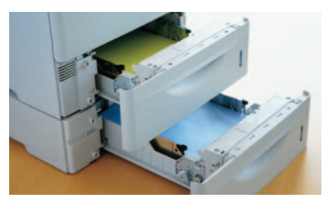
500 Sheet Optional Lower Tray Invaluable where a variety of printing stock is used!

Almost any printer will claim to be able to offer 'flexible solutions' to the modern office. Yet it is another thing altogether to be able to fulfil those claims. With the HL-6050 series, the proof is in the performance. Nowadays, most office workgroups incorporate a variety of operating systems including Windows, Mac and LINUX. The HL-6050 series has been designed specifically with this in mind and can handle input from any of these systems. Parallel and High Speed USB 2.0 ports mean connection couldn't be easier, so you are in business immediately.