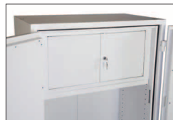
Optional Coffers** (FS1652/53/54 only)