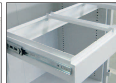
Optional Pull Out Cradle