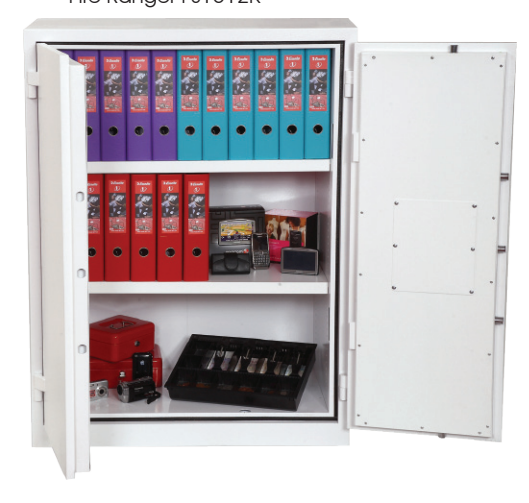
Fire Ranger F$1512K