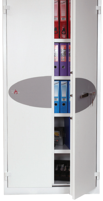
Fire Ranger F$1513K