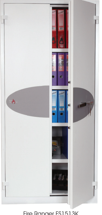
Fire Ranger FS1513K